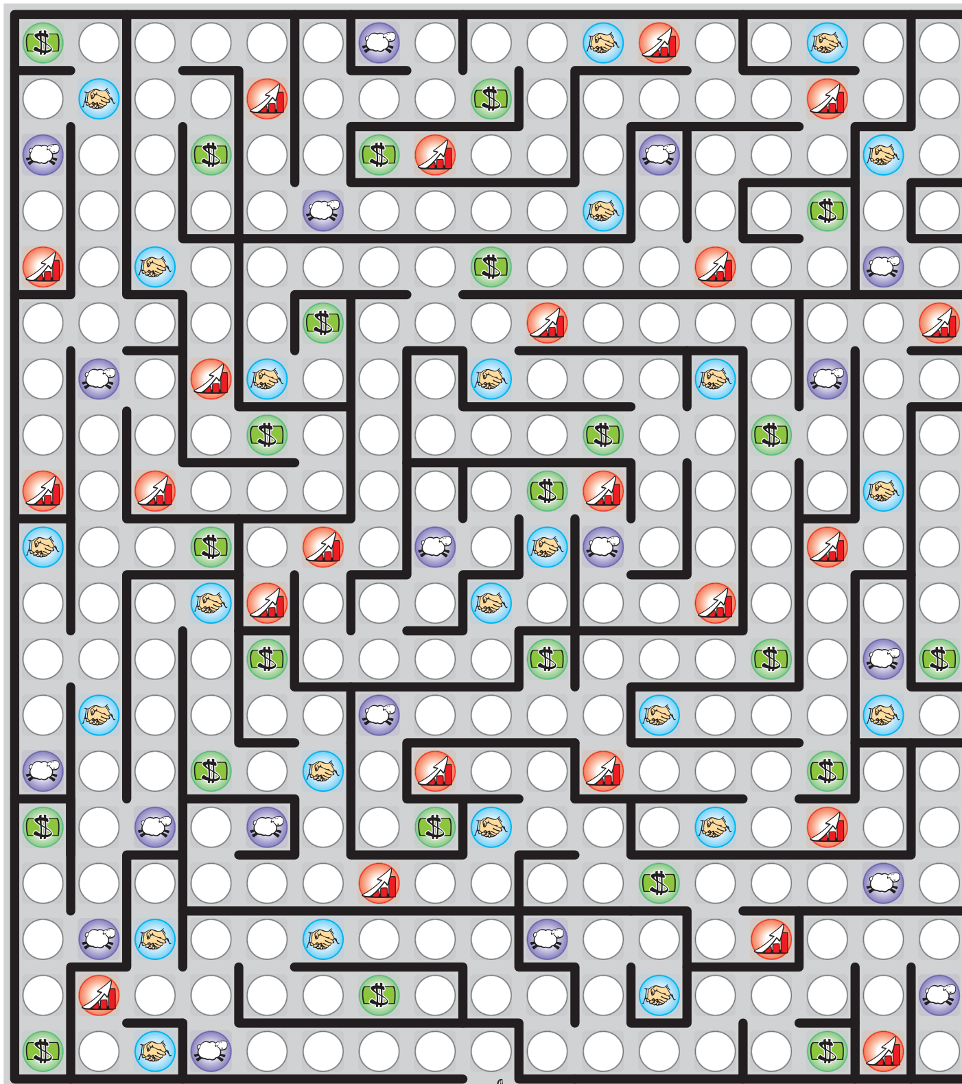
11. LABIRYNT (1/2)