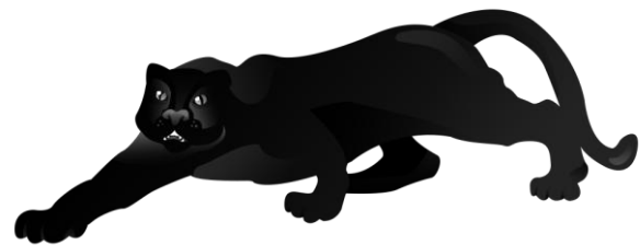
It has got sharp claws.