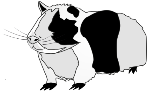
It has got small eyes.