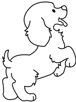
It has got brown soft fur.