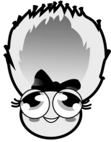
It has got long legs.