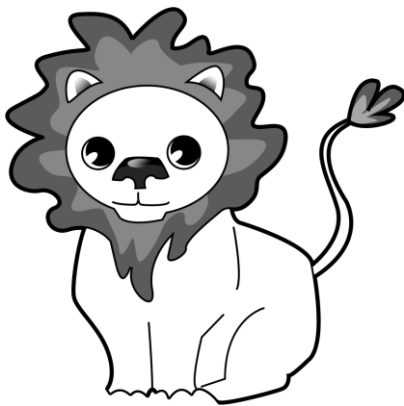
It has big paws.